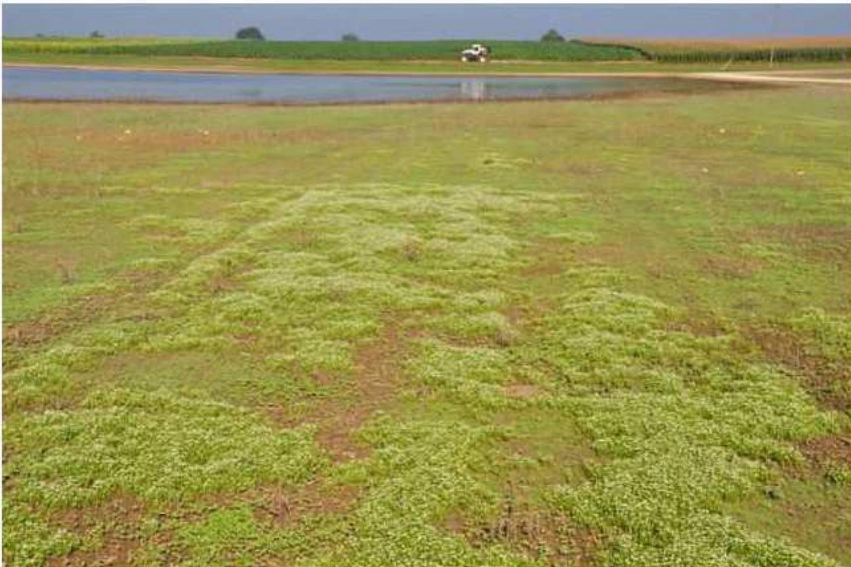
Figure 3. Temporarily flooded depression in Logan County, south side of John Young Road, with mats of Echinodorus tenellus (mostly) in foreground, agricultural crops in background.